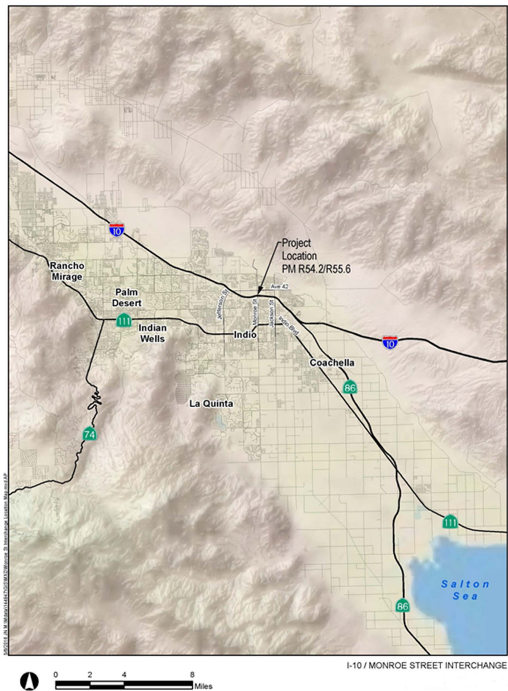
Figure 1 – Project Area